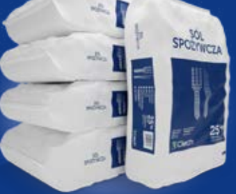
FOOD GRADE SALT