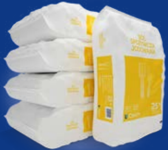
IODIZED FOOD GRADE SALT