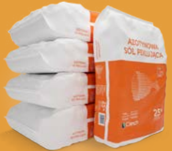
NITRITE CURING SALT 0,8-0,9% NaNO,