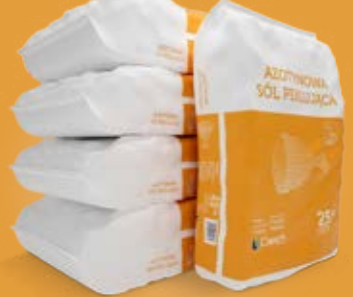
NITRITE CURING SALT 0,5-0,6% NaNO,